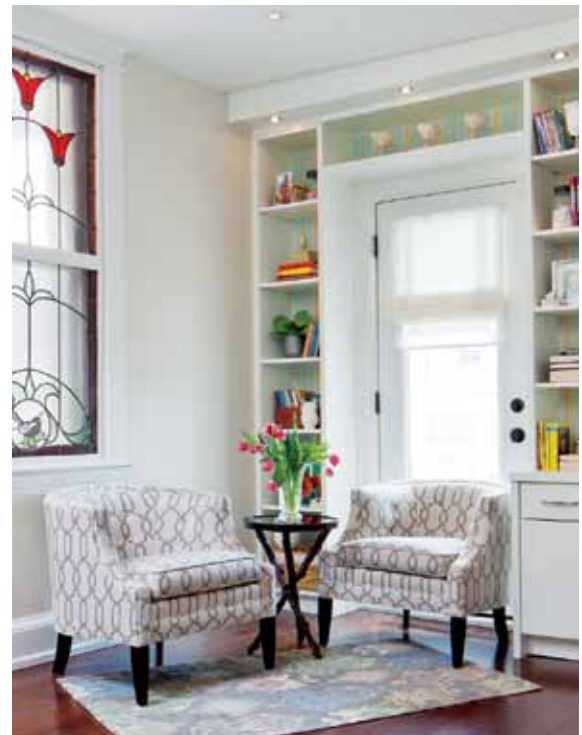
LEFT To bring new life to the landing, striped seafoam wallpaper plays on the blues introduced downstairs. New built-ins for books, as well as a pair of cozy chairs, have transformed the space into a destination for family reading.