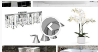
TREND WATCH: Great Gatsby Bathroom Inspiration from our Online Editor